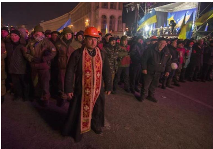
A Catholic priest leads demonstrators.