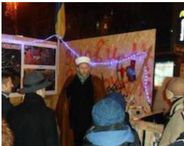
A Ukrainian Jew prays for the success of the Maidan. A Muslim Mufti speaks to Maidan demonstrators.