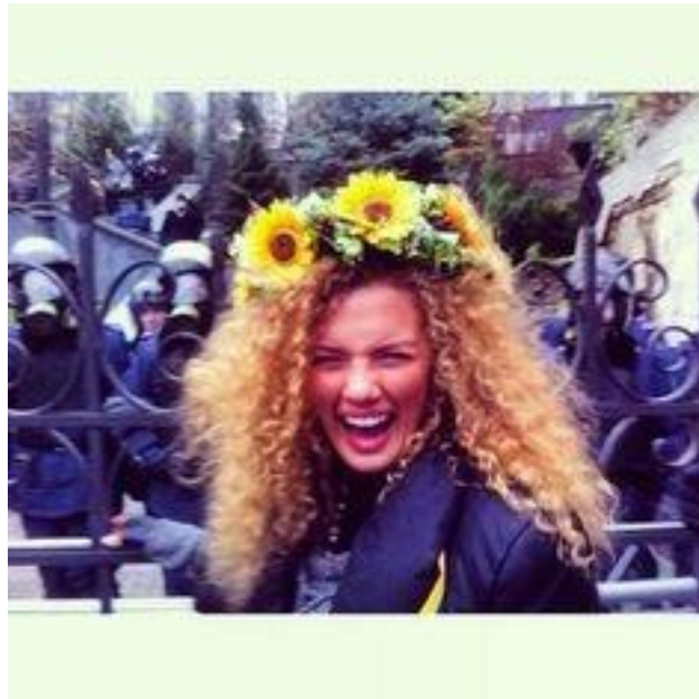
A protester on the Maidan.