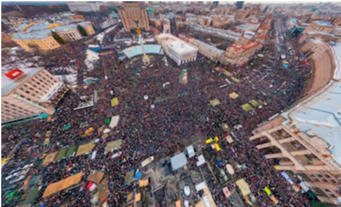
More than 200,000 demonstrators gathered on Independence Square ( Maidan Nezalezhnosti )

Additional mandatory Instructional fees (approved by Board of Governors) ✓ No