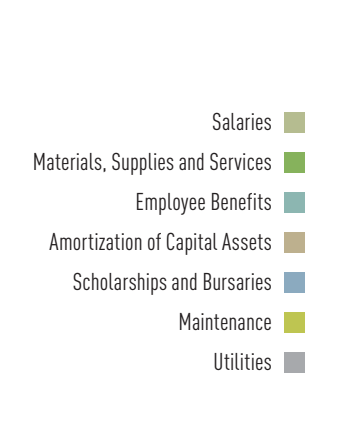
FIGURE 17 CONSOLIDATED EXPENDITURE BUDGET, 2014-15 ($MILLION)

For 2014-2015, scholarships and bursaries expense are budgeted at $85 million, marginally less than the 2013-2014 preliminary actuals. The 2014-2015 scholarship budget reflects reductions that were applied in 2013-2014, plus an adjustment based on a lower than anticipated uptake of scholarships and bursaries by students. Going forward, the university is committed to growing its scholarships and bursaries through advancement activities.