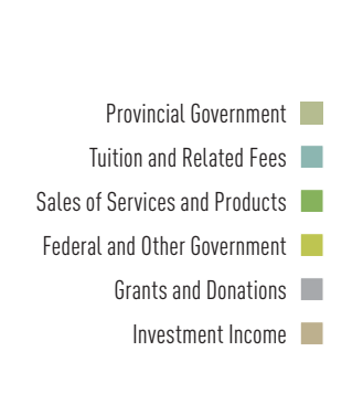
FIGURE 16 CONSOLIDATED REVENUE BUDGET, 2014-15 ($MILLION)

The other sources of consolidated revenue for 2014-2015 include grants and donations of $133 million, and investment income of $59 million.