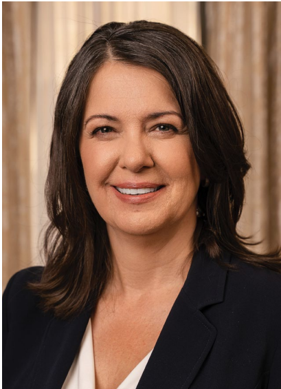
Honourable Danielle Smith Premier of Alberta

On behalf of the Government of Alberta, congratulations to the University of Alberta Class of 2023.