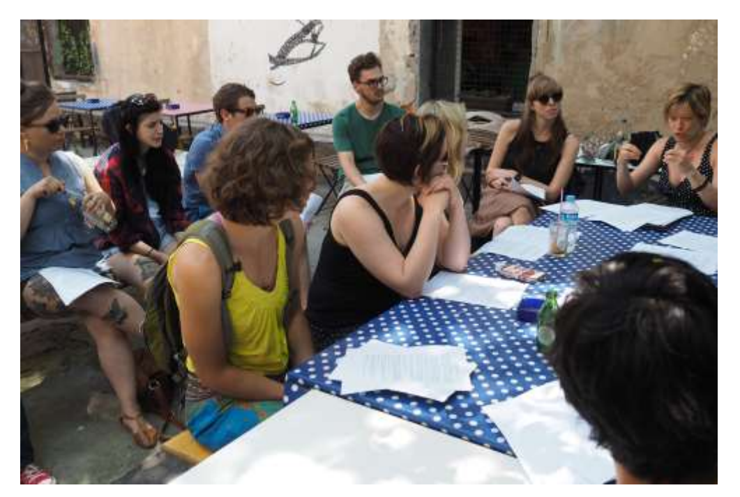
One of the first classes in the garden of the Cultural Centre "Grad"