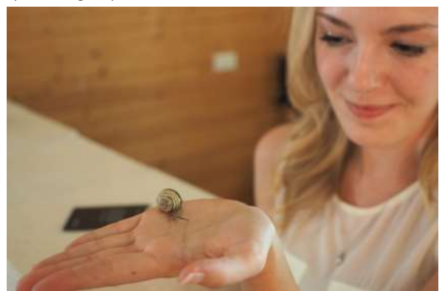
showing our mascot, totem and logo, Snailsbert