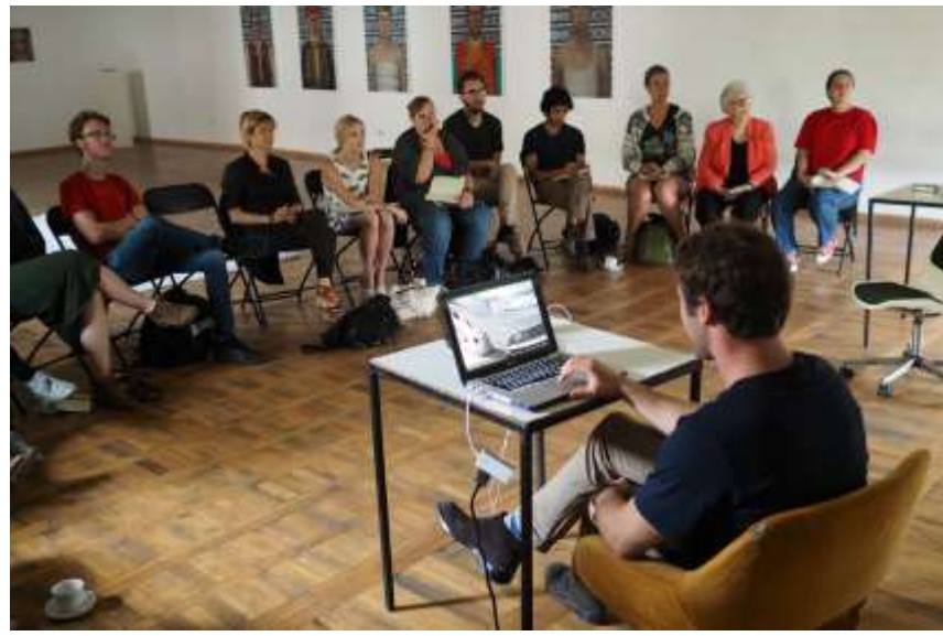
presenting his photo-series in class