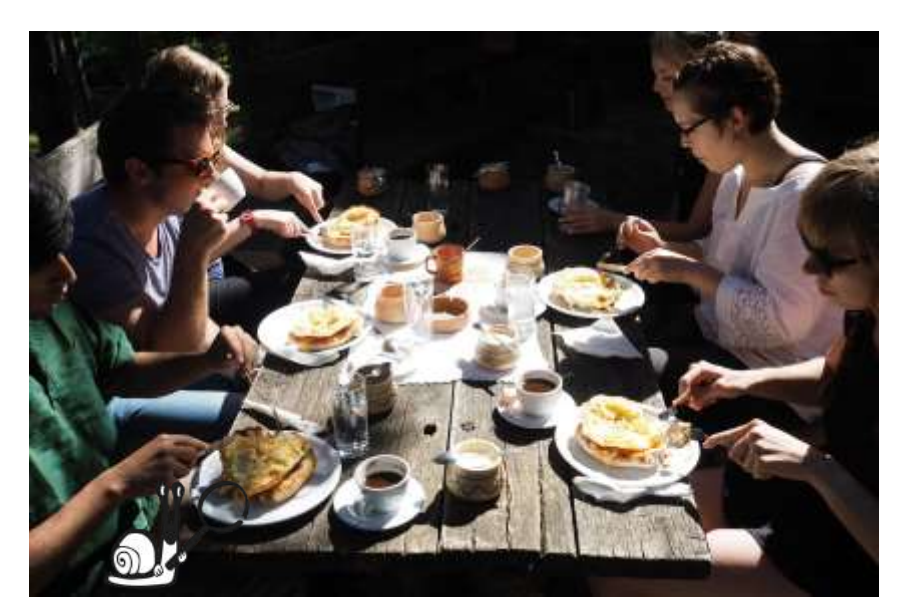
A hearty peasant-style breakfast in Old Village