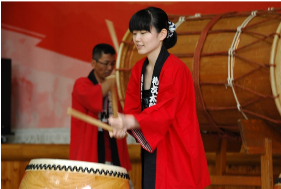
Taiko song and lesson

BHAP organized a day of cultural interaction for the students of the 2015 field school. This involved Taiko drumming, origami, kendama, and other activities. All of these activities were instructed by locals.