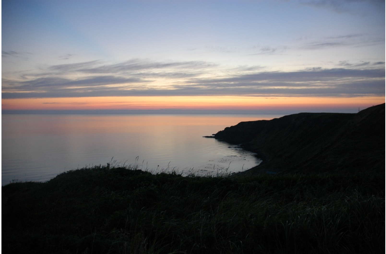
Sunset on Rebun Island, Hokkaido, Japan