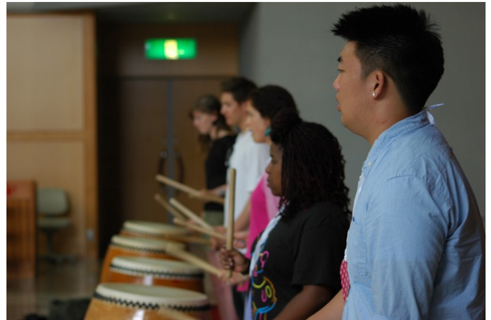
Students trying out Taiko drumming